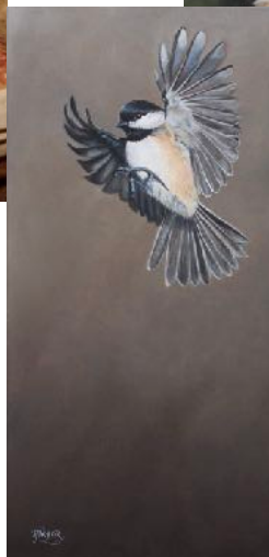
A sampling of one day oil painting workshops I have done