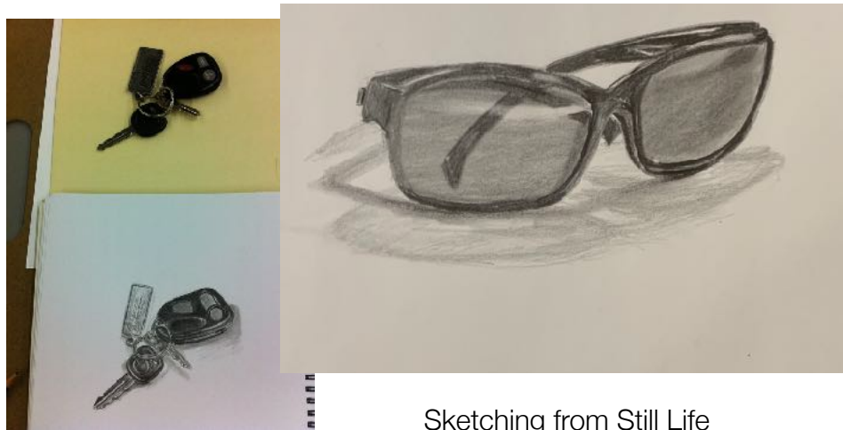
Sketching from Still Life

One day workshops also work well for sketching and drawing classes from still life displays. My charge to the club for a one day workshop is $400.00 or $160.00/person with a minimum of 4 students. If I do a drawing/sketching from life workshop I will bring in and set up the display, but also invite students to bring objects of their choice to add to it if they desired to draw them. The focus of outcomes in this workshop would be learning about form, values, composition, and perspective. I would cover different techniques for obtaining correct sizing and angles, and perspective of the objects they are drawing. As well as different shading techniques like hatching and crosshatching to tonal sketching where there are no visible lines.